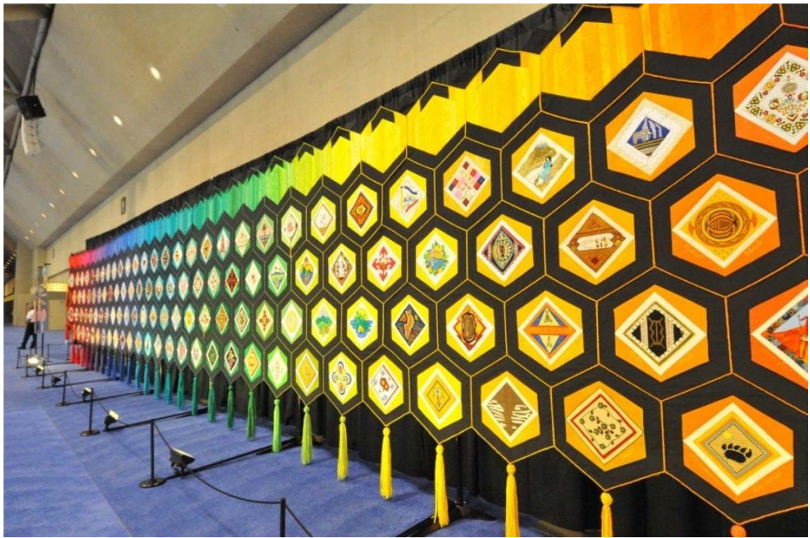
"The Quilt of Belonging," 36 metres long collaborative textile art project whose 263 blocks portray the rich cultural legacies of all the First Peoples in Canada and every nation of the world. Artists from the Arctic Circle and coast to coast contributed to this quilt.

July 1, 2018 - Twilight Recital at 4:00pm; Choral Evensong at 4:30pm