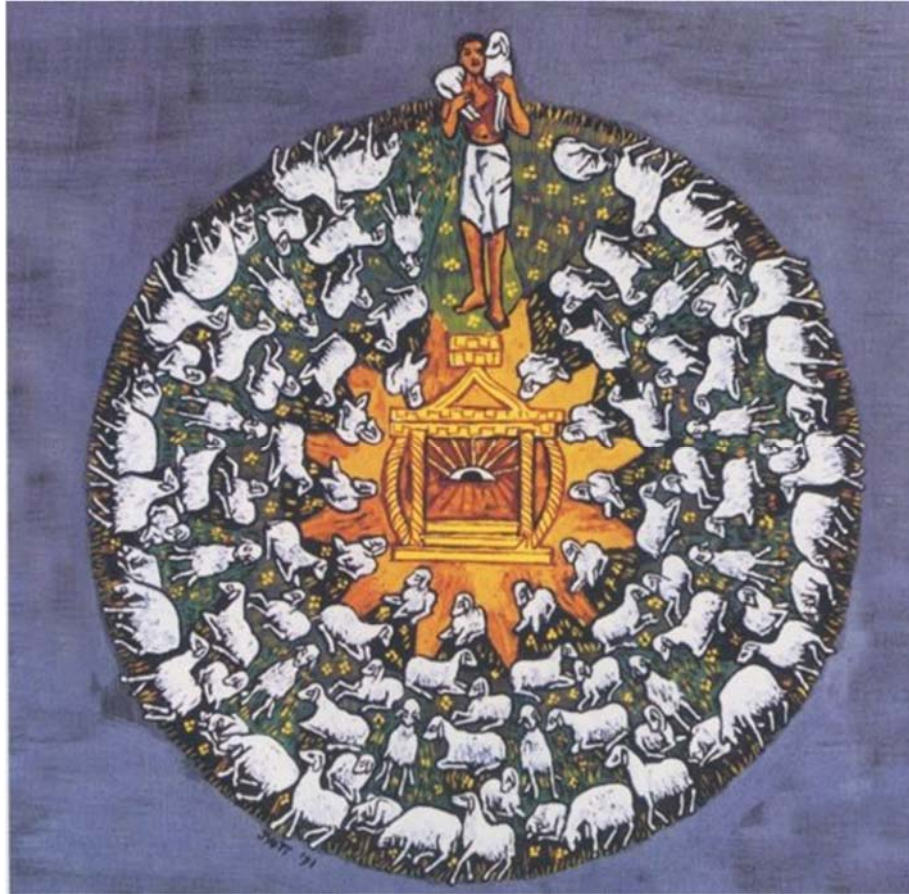
"Mandala of the Good Shepherd" by Jyoti Sahi, India.

July 22, 2018 - Sung Eucharist at 9:00am