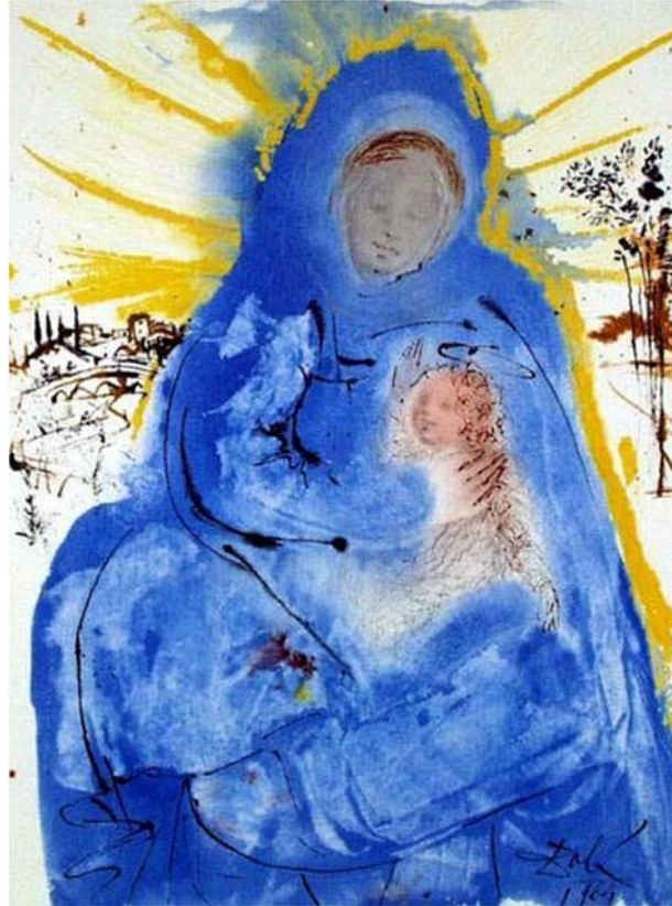
"Die Blaue Madonna," by Salvador Dalí, Figures, Spain: 1965.

September 9, 2018 - Sung Eucharist at 9:00am