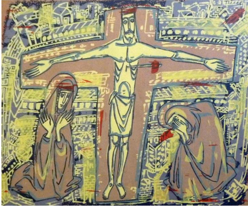
Sister Mary Corita Kent, Christ Suffering Over Jerusalem (Serigraph, 1951).

November 11, 2018 - Sung Eucharist at 9:00am