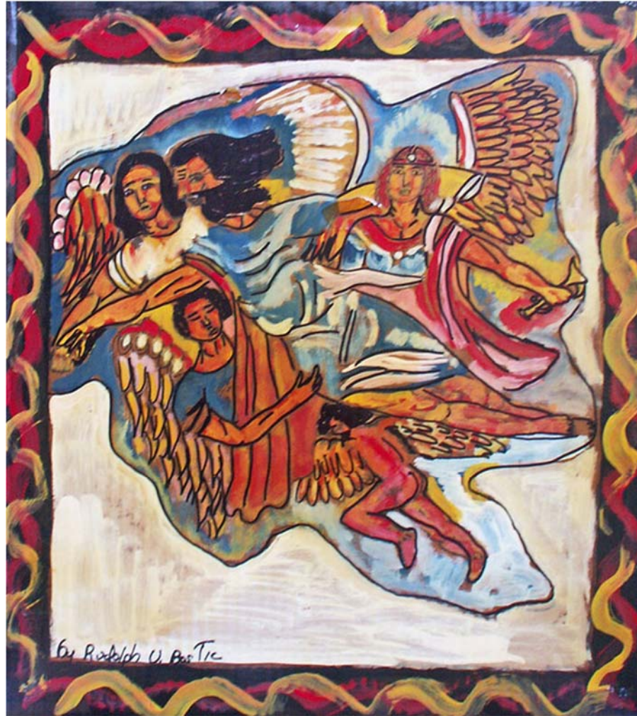
The Creation (After Michelangelo) by Rudolph Valentino Bostic. Mixed media on cardboard.

November 18, 2018 - Choral Eucharist at 11:00am