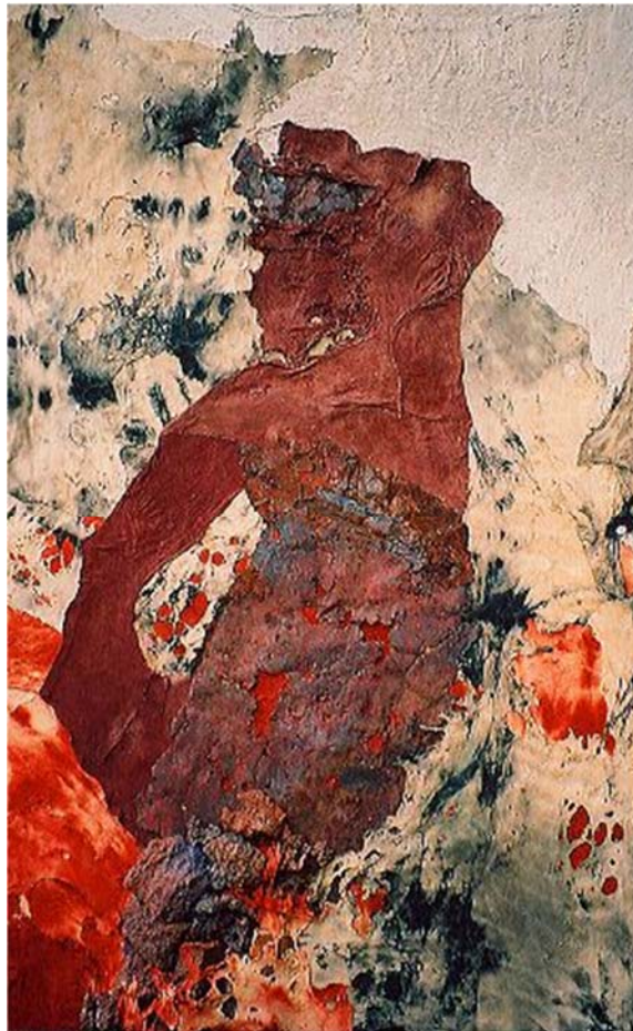
Remember Me by Barbara de Reus Kamma, New Guinea, 1992.

December 9, 2018 - Twilight Recital at 4:00pm; Choral Evensong at 4:30pm