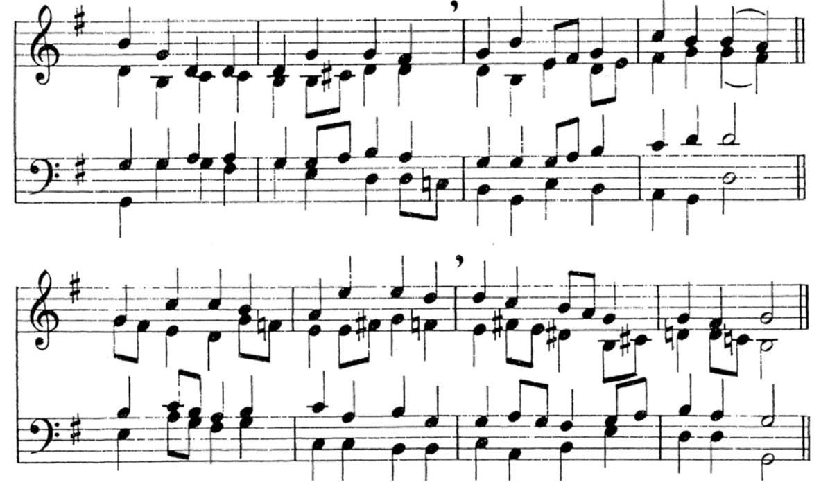
Hymn text Come, thou long-expected Jesus, born to set thy people free; from our fears and sins release us; let us find our rest in thee.

Israel's strength and consolation, hope of all the earth thou art; dear desire of every nation, joy of every longing heart.