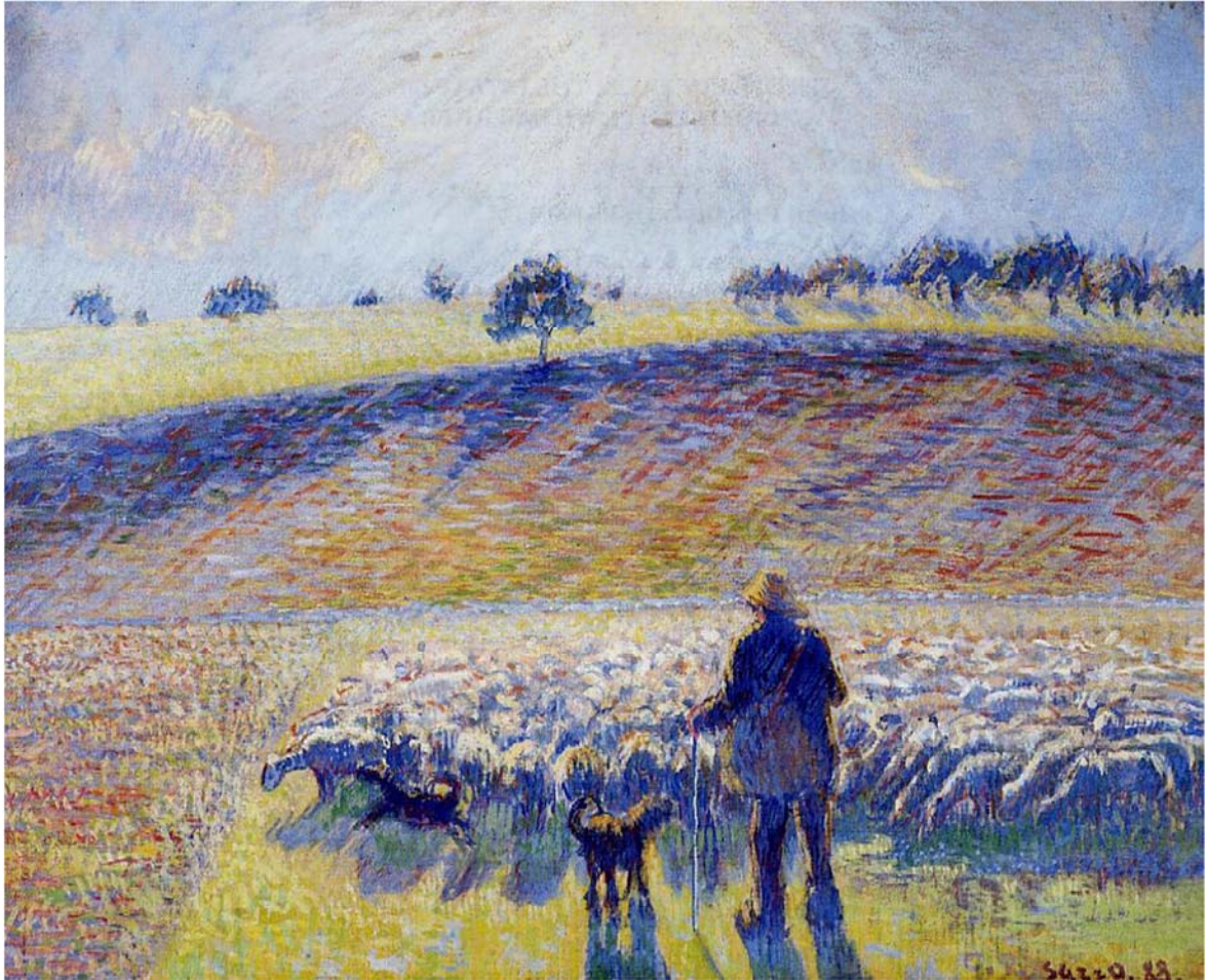
Camille Pissarro, "Shepherd and Sheep", 1888.

May 5, 2019 – Choral Eucharist at 11:00am