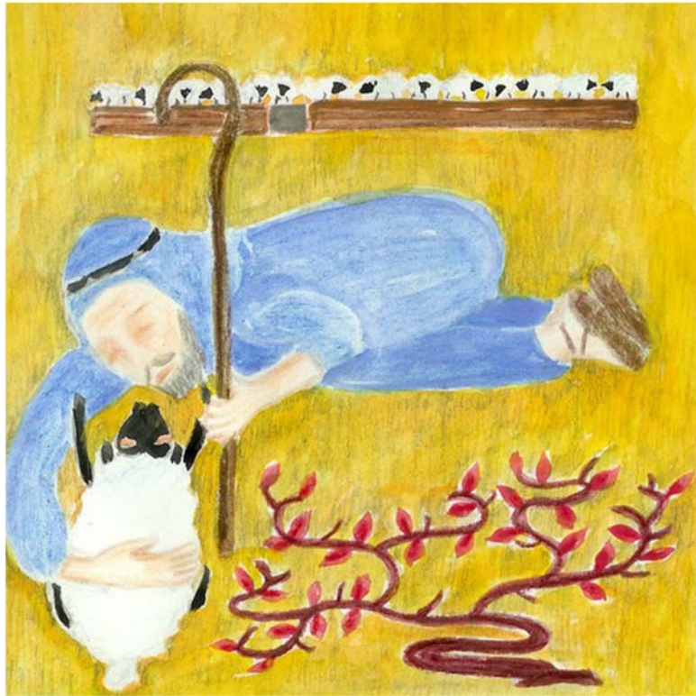
John Kohan, mixed media on paper, detail from The Parables of Jesus.

At the center of the Church's life there is this sacrificial, self-giving eucharistic love, then where are the Church's boundaries, where is the periphery of this center? Here it is possible to speak of the whole of Christianity as an eternal offering of the Divine Liturgy beyond church walls. What does this mean? It means that we must offer the bloodless sacrifice, the sacrifice of self-surrendering love not only in a specific place, upon the altar of a particular temple; the whole world becomes the single altar of a single temple, and for this universal Liturgy we must offer our hearts, like bread and wine, in order that they may be transubstantiated into Christ's love, that he may be born in them, that they may become "God-human" hearts, and that he may give these hearts of ours as food for the world, that he may bring the whole world into communion with these hearts of ours that have been offered up, so that in this way we may be one with him, not so that we should live anew but so that Christ should live in us, becoming incarnate in our flesh, offering our flesh upon the Cross of Golgotha, resurrecting our flesh, offering it as a sacrifice of love for the sins of the world, receiving it from us as a sacrifice of love to himself. Then truly in all ways Christ will be in all.