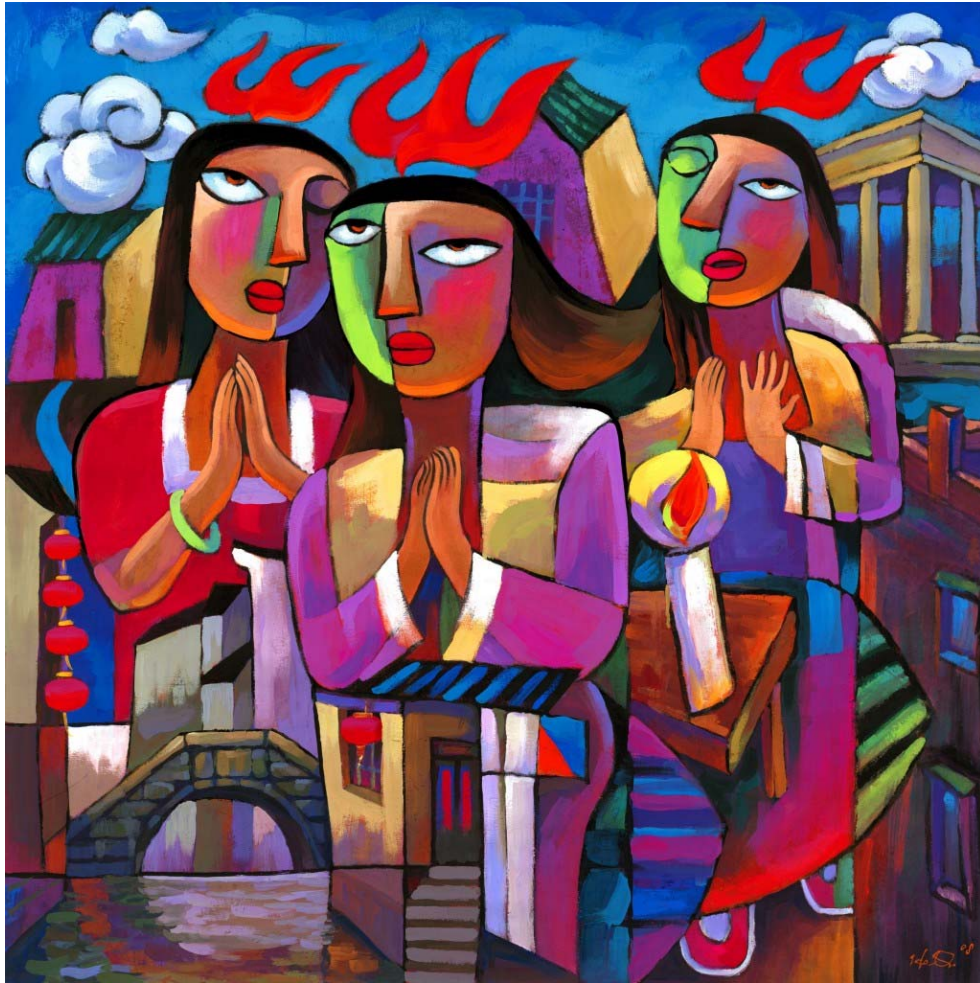
Holy Spirit Coming, He Qi, 2013.

June 9, 2019 - Twilight Recital at 4:00pm; Choral Evensong at 4:30pm