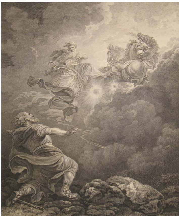
The Ascent of Elijah - Philippe-Jacques de Loutherbourg

June 30, 2019 – Choral Eucharist at 11:00am