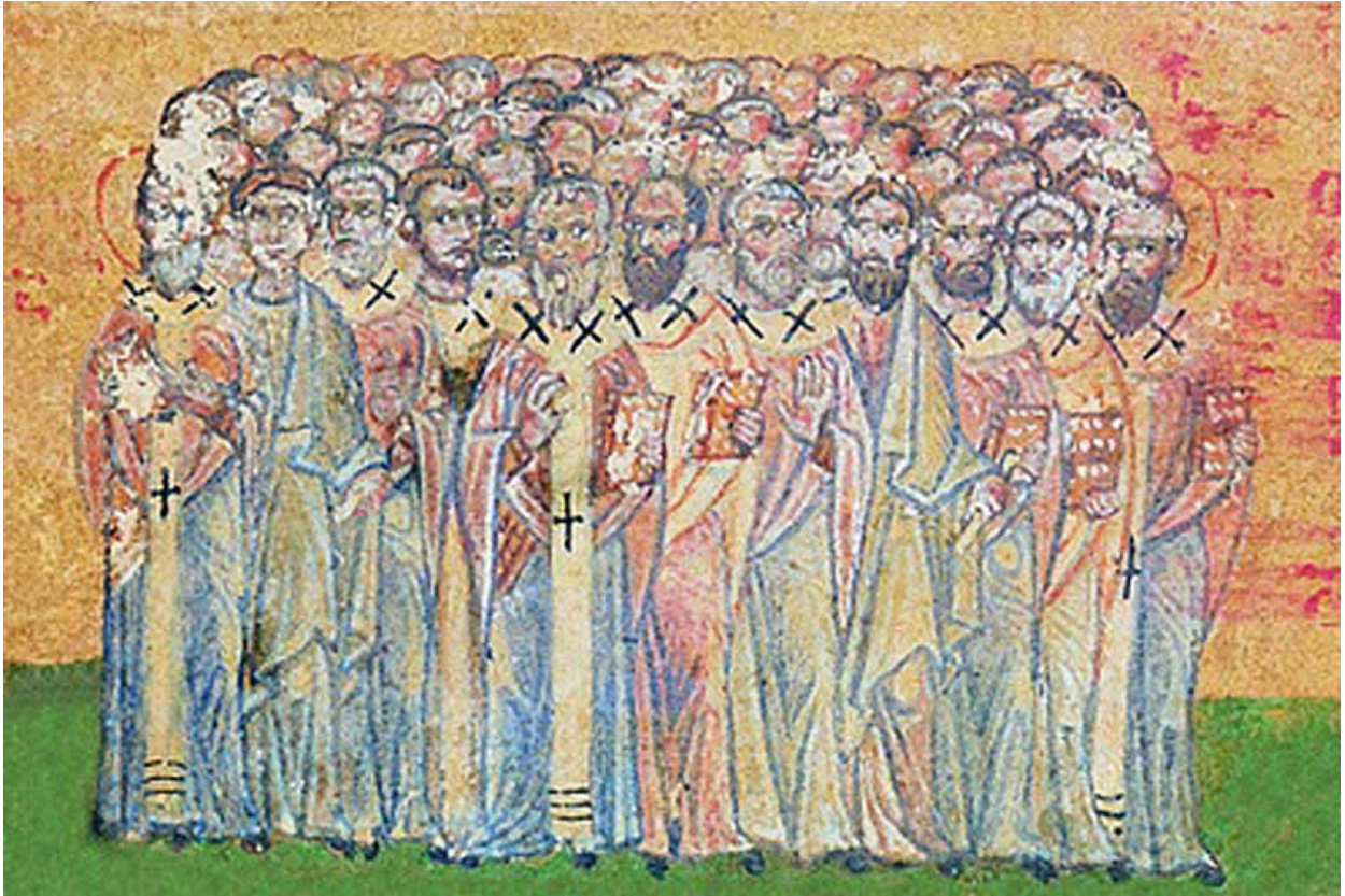
Seventy Disciples – Greek Manuscript

July 7, 2019 – Choral Eucharist at 11:00am