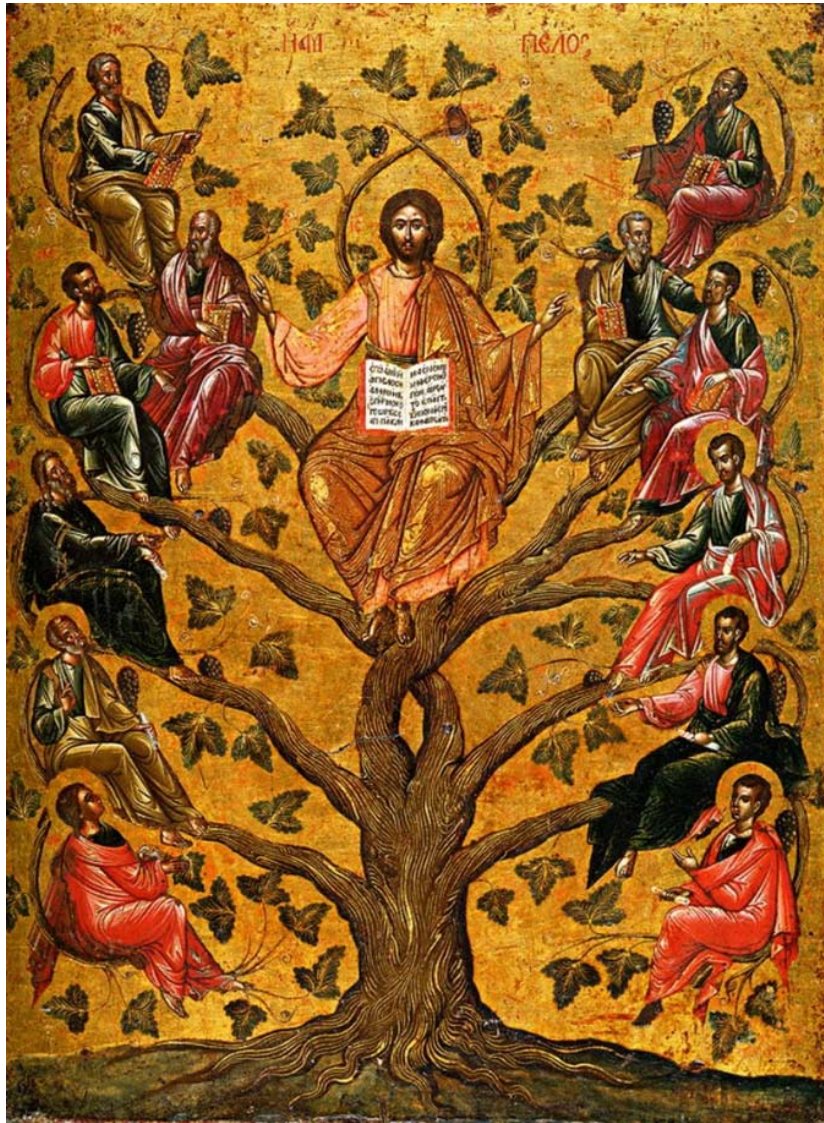
Christ the True Vine – Eastern Orthodox Icon

Sung by the Toronto Diocesan Choir School for Girls