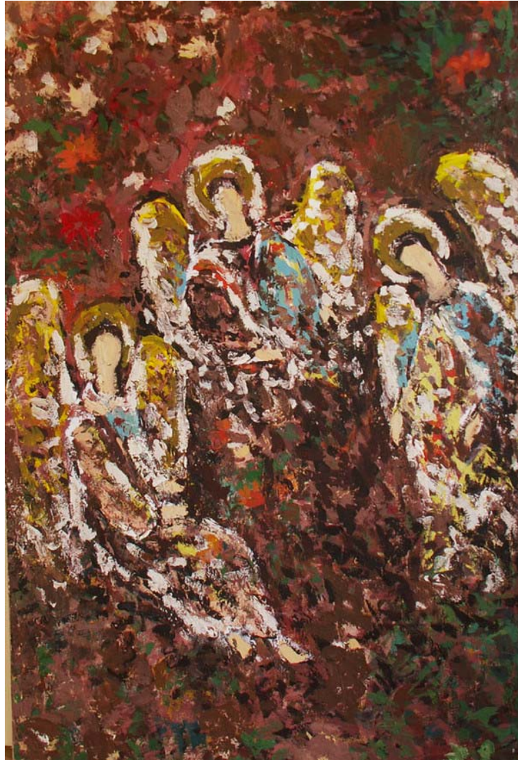
Anna Kelogregovi, Choir of Angels, acrylic on panel.

September 29, 2019 - Twilight Recital at 4:00pm; Choral Evensong at 4:30pm