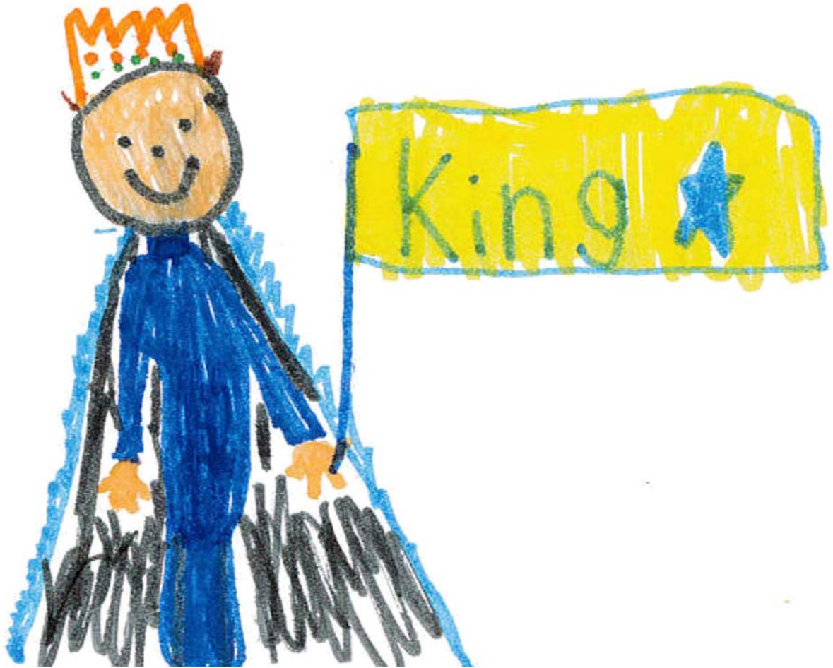
Untitled drawing, Grade 1 Havergal College student, 2014.

November 24, 2019 - Choral Eucharist at 11:00am