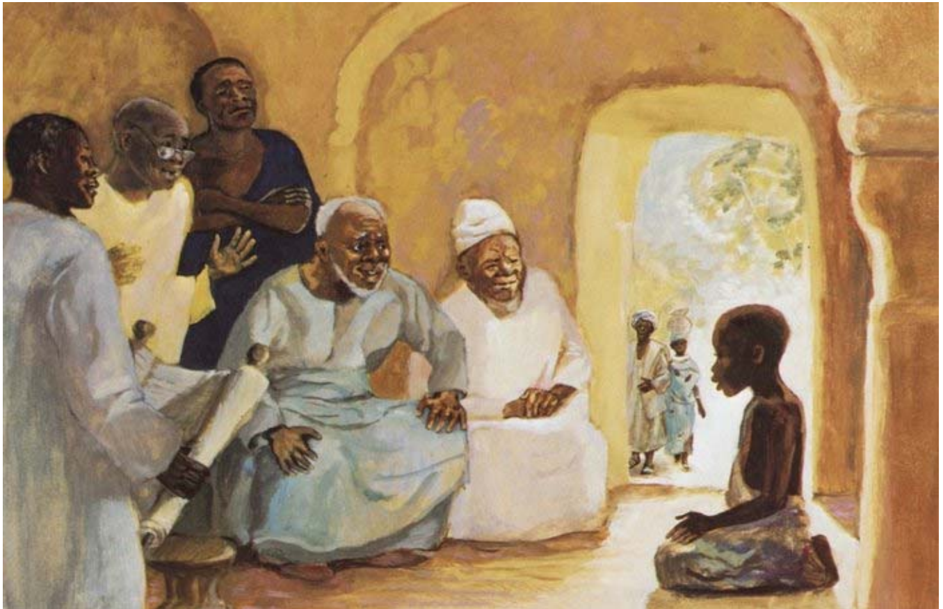
Jesus Among the Teachers - Jesus Mafa, Cameroon

December 29, 2019 - Sung Eucharist at 9:00am