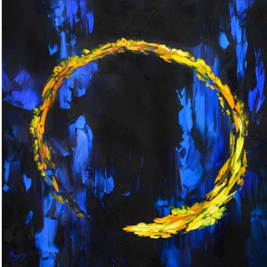
The Days Are Surely Coming - Mike Moyers

January 5, 2020 - Sung Eucharist at 9:00am