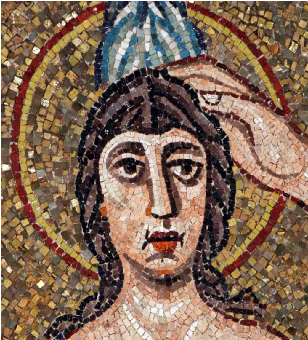
Baptism of Christ, detail, from 'Art in the Christian Tradition', a project of the Vanderbilt Divinity Library, Nashville, TN.

January 12, 2020 - Choral Eucharist at 11:00am