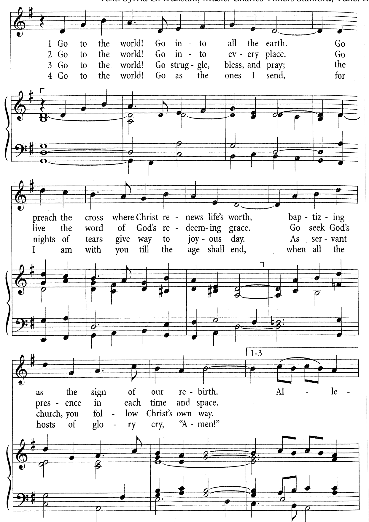
Hymn continues on next page.