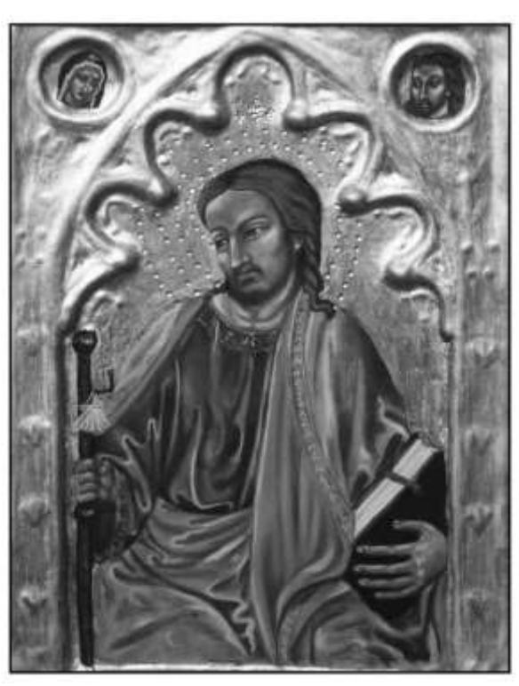
"St. James The Greater" By Constantina Wood (2011)

The next time you enter the Cathedral of St. James, in the southwest portico, notice the stained-glass window that was designed by Stuart Reid and dedicated by Queen Elizabeth II on June 29, 1997.