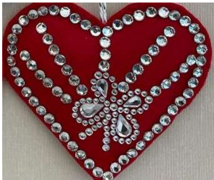
“The Heart of the City” handcrafted ornament