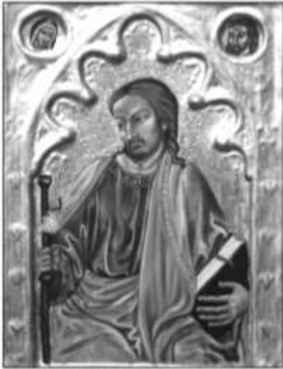
“St. James The Greater”