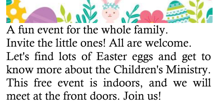
Sunday, March 31: Easter Egg Hunt from 12:30pm-1:30pm

<u>group/</u>, E-Connections (link), our website Blessed Sacrament at 6:45pm. (News), or after services.