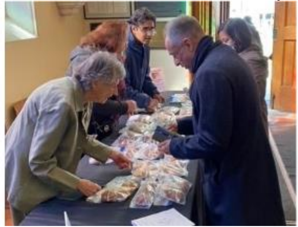
TODAY: Hot Cross Buns on Palm Sunday

3 buns for $5 after each of the morning A fun event for the whole family.services in the South West Porch and in Snell Invite the little ones! All are welcome.Hall. Proceeds support the foot care clinic of Let's find lots of Easter eggs and get to know more about the Children's Ministry.