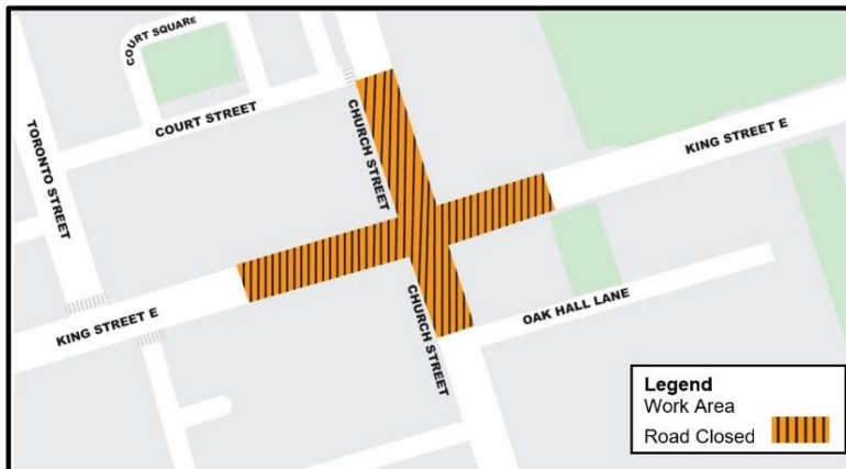
MAP OF PROJECT AREA

The City of Toronto has closed the King Street East and Church Street intersection to vehicles and bicycles for additional water repairs and TTC track work.